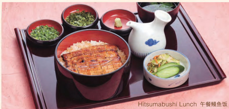
Hitsumabushi Lunch 午餐鳗鱼饭

*The shapes of the eel pieces may be different in each dish and on different days, but the same dishes by name will have the same amounts of eel. *The raw materials may include wheat. *Upgrade your soup to our eel-liver soup for an extra 200 yen.