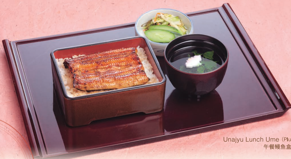
Unajyu Lunch Ume (Plum: Small) 午餐鳗鱼盒饭 梅(小)