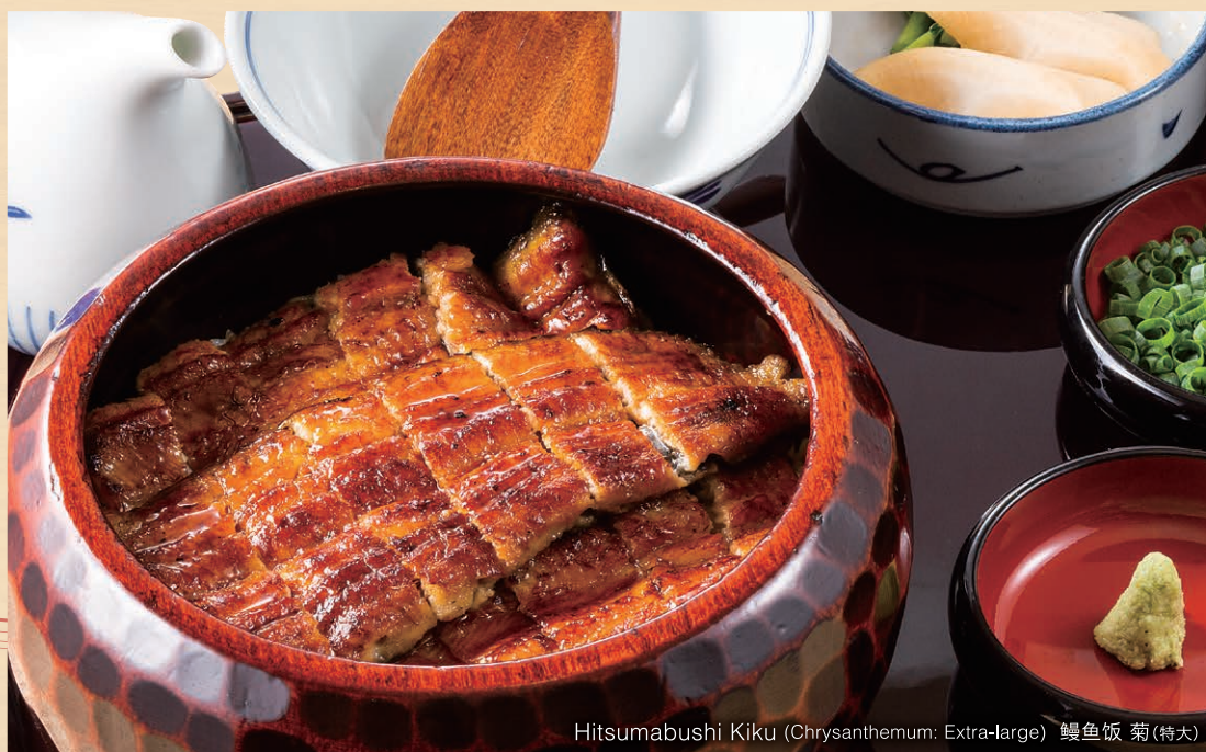
Hitsumabushi Kiku (Chrysanthemum: Extra-large) 鳗鱼饭 菊(特大)