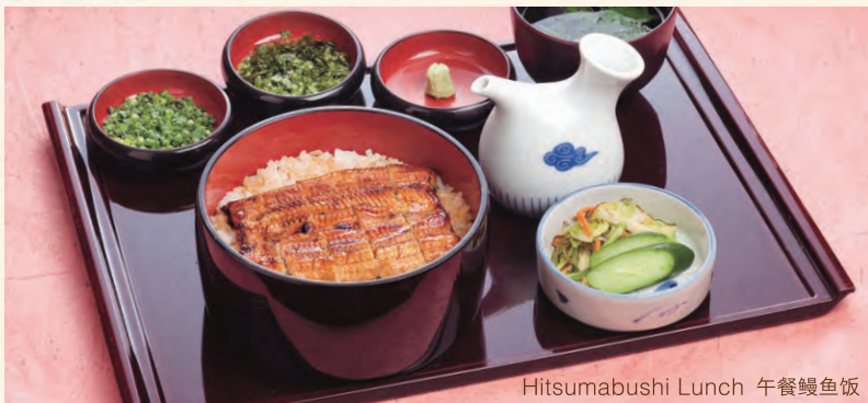
Hitsumabushi Lunch 午餐鳗鱼饭

*The shapes of the eel pieces may be different in each dish and on different days, but the same dishes by name will have the same amounts of eel.