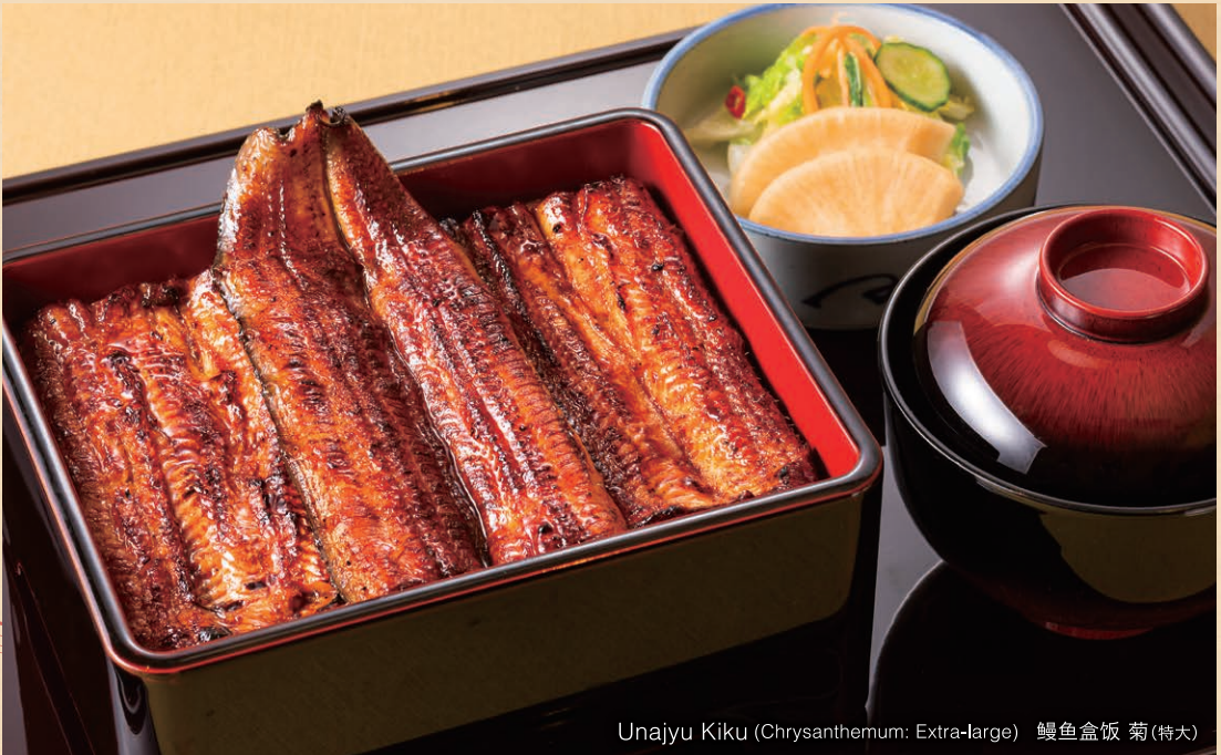
Unajyu Kiku (Chrysanthemum: Extra-large) 鳗鱼盒饭 菊(特大)